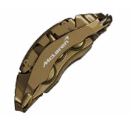
MSO Defined Bronze with Machined McLaren logo