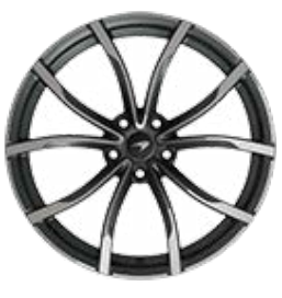
Dark Stealth Diamond Cut