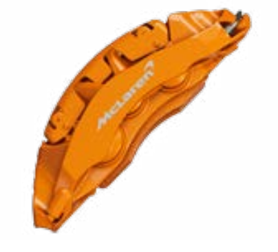
McLaren Orange with Machined McLaren logo