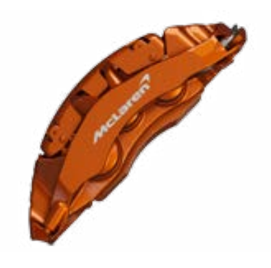
Azores with Machined McLaren logo