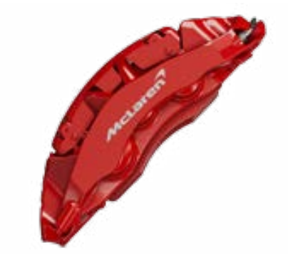
Red with Machined McLaren logo