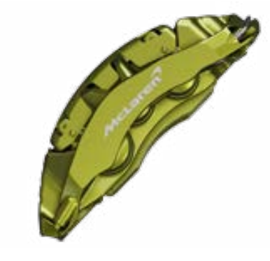
Flux Green with Machined McLaren logo