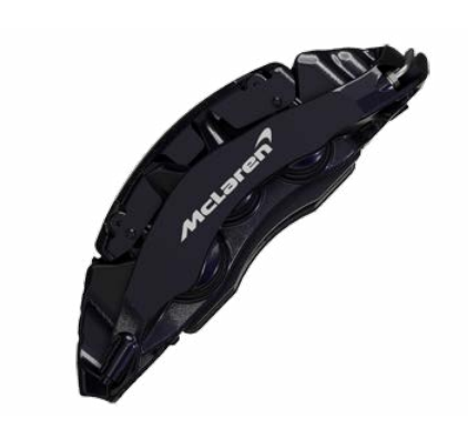
Black with Silver printed McLaren logo