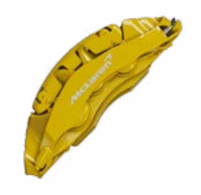
Yellow with Machined McLaren logo