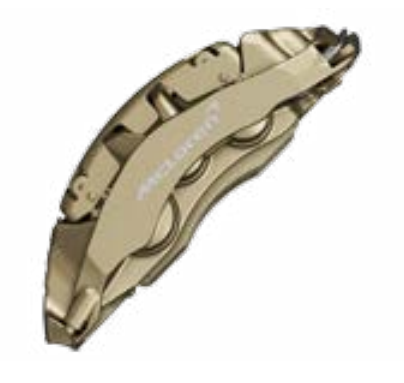
MSO Defined Speedline Gold with Machined McLaren logo