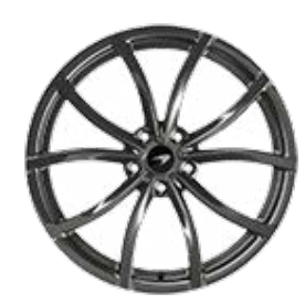
Titanium Liquid Metal