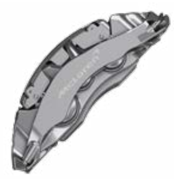
Polished with Machined McLaren logo